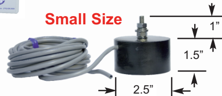
Single Code Transmitter